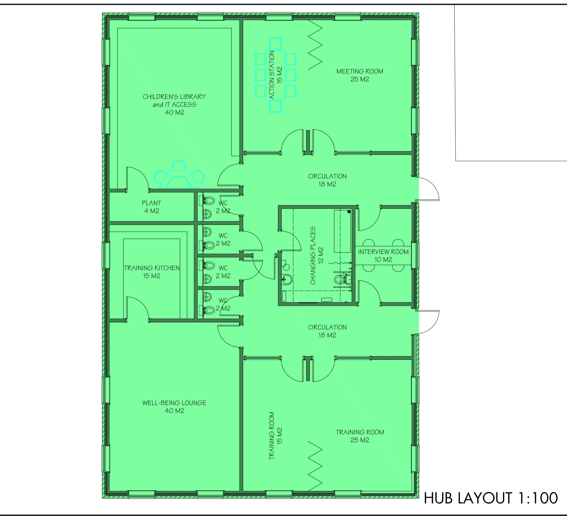
HUB LAYOUT 1:100