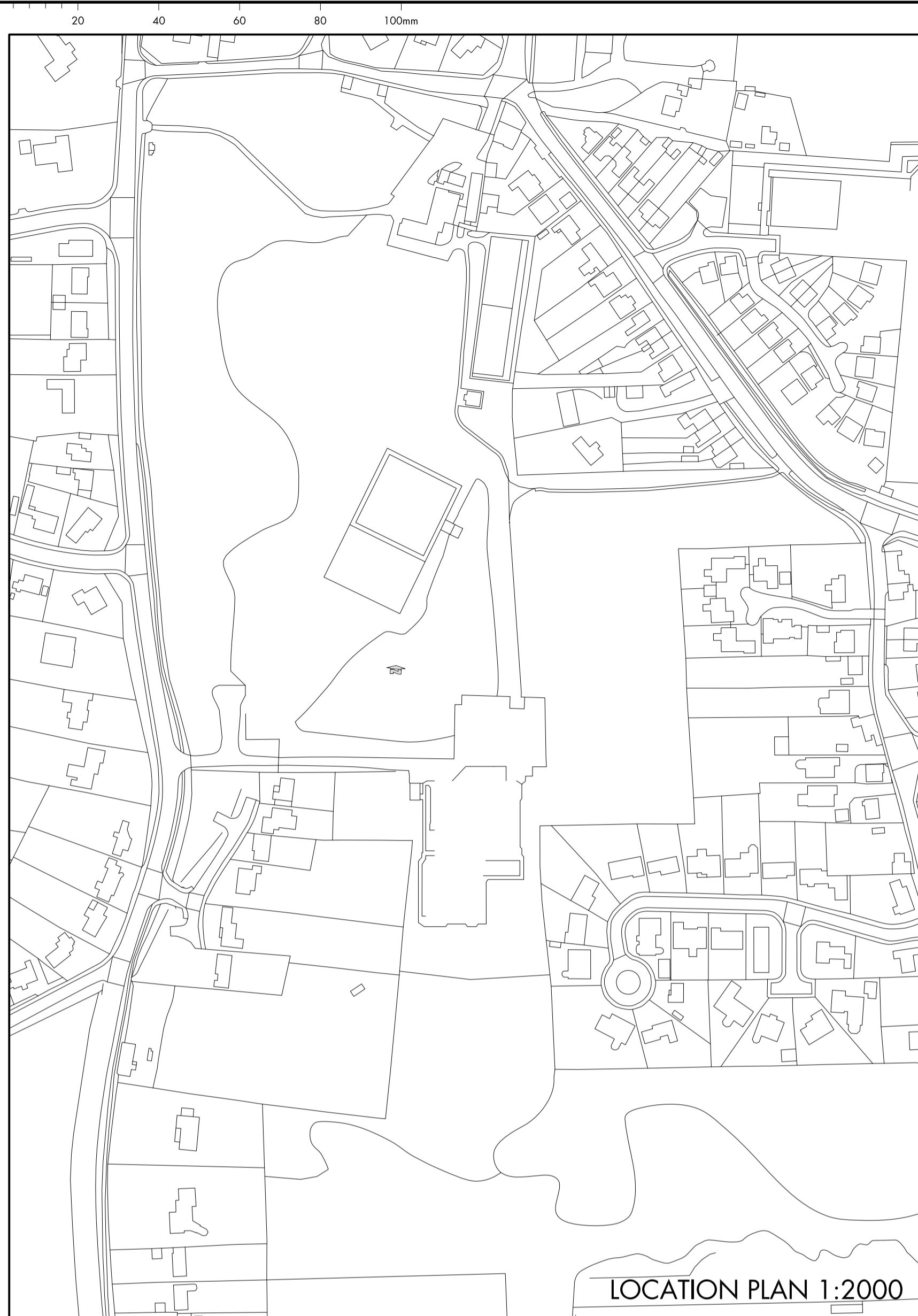
LOCATION PLAN 1:2000